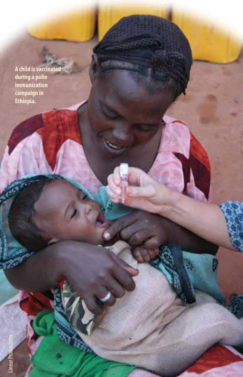
A child is vaccinated during a polio immunization campaign in Ethiopia.

Noting the example of his own country, K.O Antwi-Agyei shared that Ghana implements a "comprehensive approach