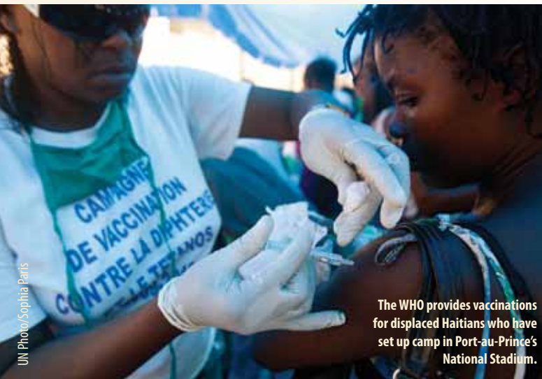
The WHO provides vaccinations for displaced Haitians who have set up camp in Port-au-Prince's National Stadium.