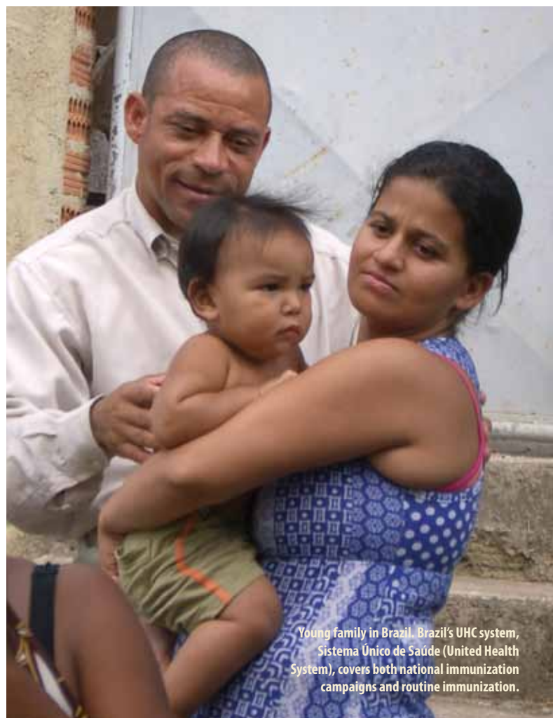
Young family in Brazil. Brazil’s UHC system, Sistema Único de Saúde (United Health System), covers both national immunization campaigns and routine immunization.

Participants generally concurred that the price of individual vaccines matters and will be a key factor in determining whether countries decide to include them in health and UHC budgets in the future. Making the case to continue