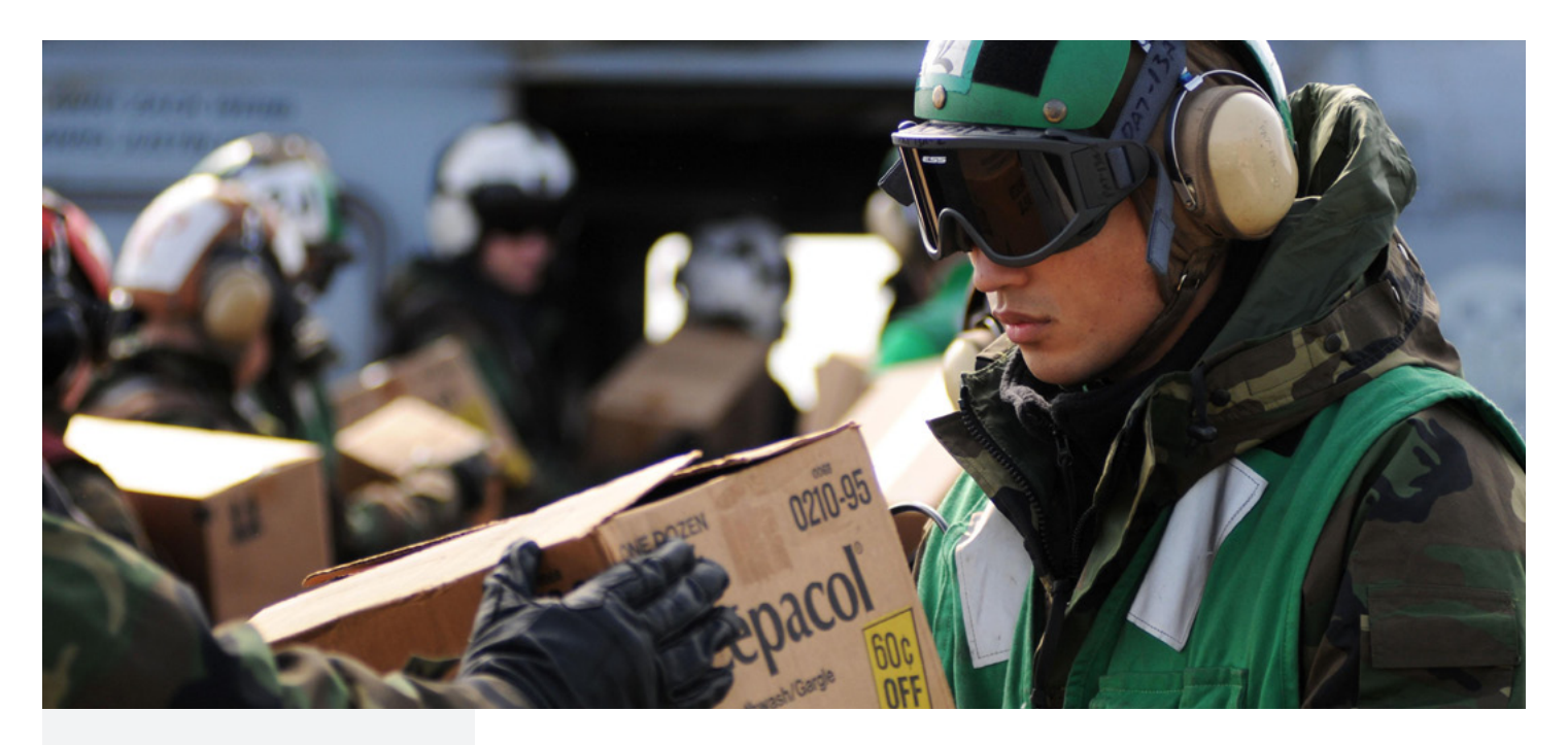
U.S. Navy airman loads supplies into a helicopter aboard the USS Ronald Reagan .